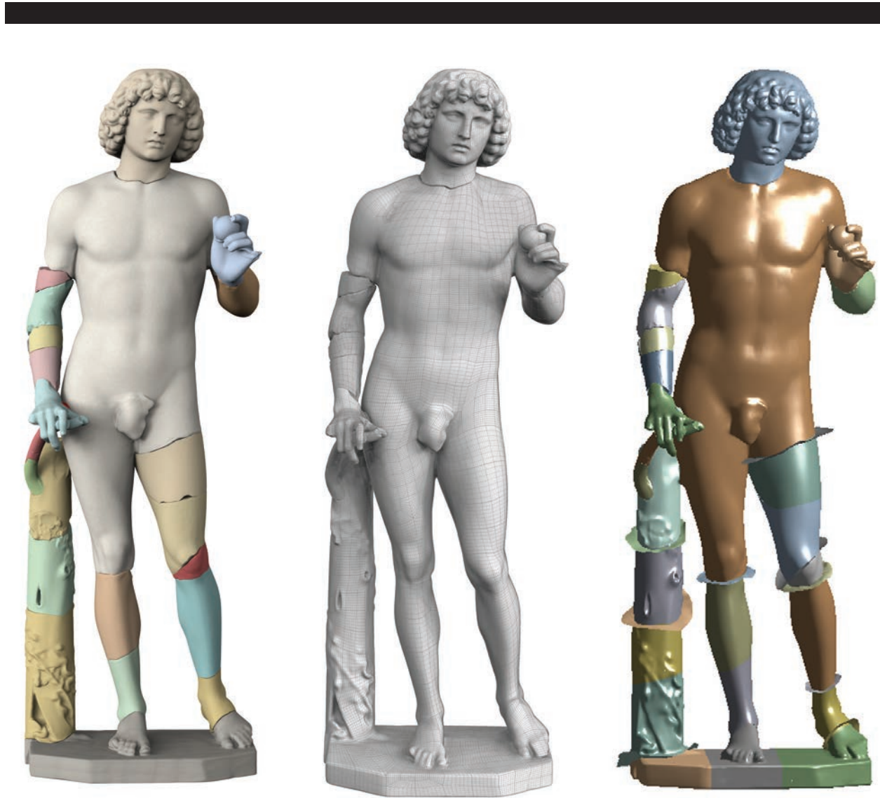
▲ Finite element models of Adam . Left: assembled NURBS model. Center: continuous NURBS model with bonded contacts. Right: hybrid model with imported surfaces from one side of the fracture interface generated from the fragment boundaries of the laser-scanned model, which was utilized to represent fracture surfaces

The challenge then became how to rebuild Adam – a 3-D jigsaw puzzle of brittle marble with some of the pieces missing because they had been pulverized. Street's experience with 3-D graphics led him to suggest scanning each piece with a laser and then using software to determine how these pieces fit together. These scans also allowed the Met's conservation team to machine full-scale polyurethane foam replicas of the larger pieces so that they could construct an external support armature composed of form-fitting carbon