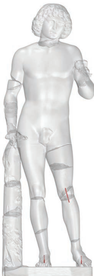
▲ 3-D model of Adam showing major breaks and locations of three fiberglass pins, in red

The conservation of Adam was a unique project for conservators and engineers alike. It was a learning experience for everyone involved, as every participant sought to understand the concerns,